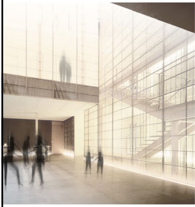
SHARE SPACE VIEW NIGHT VIEW