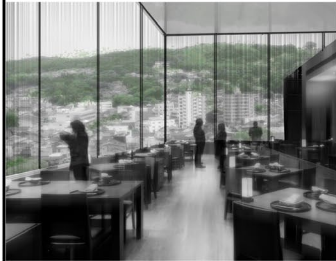
ELEVATION ROOF TOP VIEW

PROJECT 1 As explained before, high rises in that part of the city gonna be refurbished to become big scale landmarks. According to our concept, we choose to develop a sustainable architecture and propose new facilities; as sport center, restaurants, public gardens, to improve the inhabitant quality of life. The new type of irrigation, taking advantage of the rain by draining water from the top to the bottom, and using traditional fusuma system, to increase the natural air circulation into the building, makes this building more attractive than before. Even kitchen gardens for inhabitant are created to give then the possibility to growth vegetables, and fruits. Making this experience of living unique and innovative, enjoying their live and the city and having a new regard and judgment about Kanazawa.