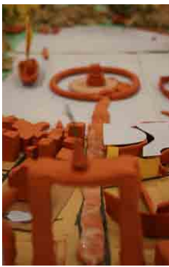
Detail of model