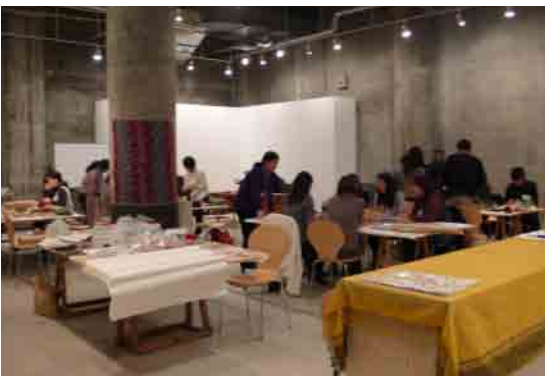
Overall view of workshop in progress