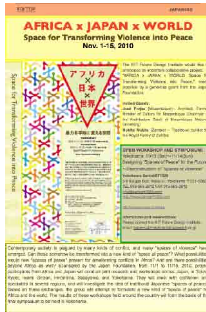
Information web page