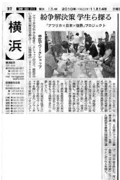
Asahi Shimbun, Tokyo Edition Sunday, Nov. 14