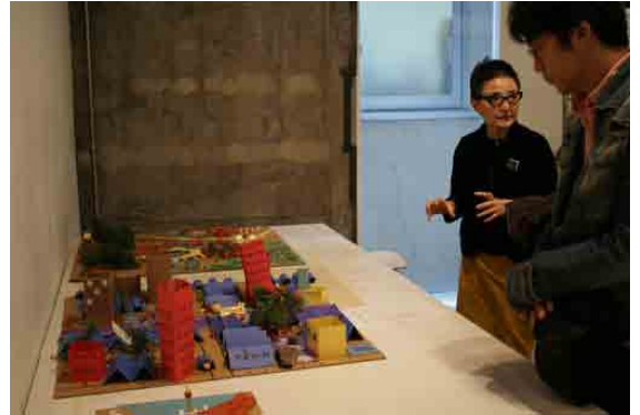
Ms Takeshita explains workshop results