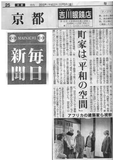
Mainichi Shimbun, Kansai edition, Friday, Nov. 5