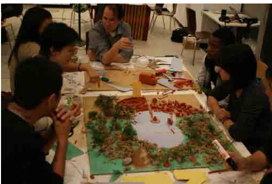
"World Heritage" scenario team at work