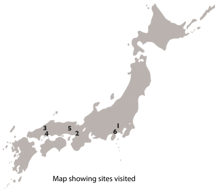
Map showing sites visited