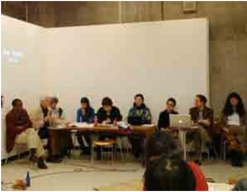
Symposium speakers during presentations