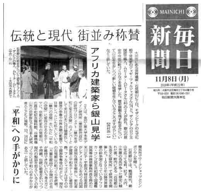
Mainichi Shimbun, Kansai edition, Monday, Nov. 8