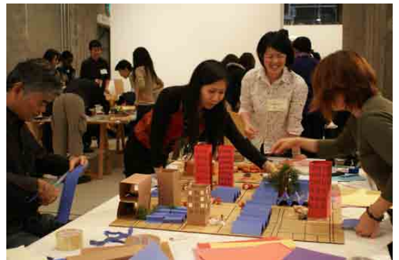
"City Redevelopment" scenario team at work