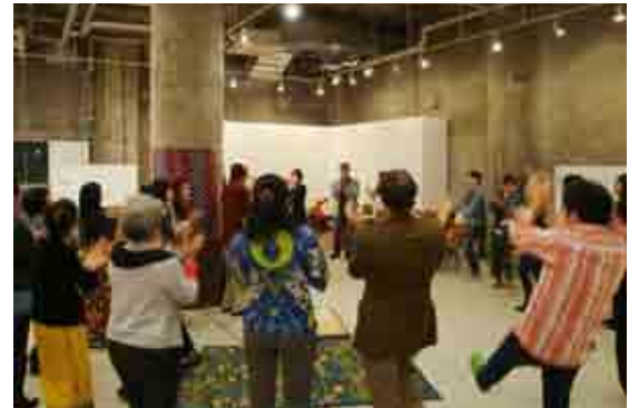
Spontaneous dancing closed the symposium

Meeting: A final meeting was held with all project team members at a restaurant in Chinatown. The organization of all materials gathered during the project -photos, texts, videos, etc -- was discussed, as was the possible form of the final output. All team members expressed the desire to continue to work together as a team, and agreed about the importance of applying for a grant to bring the work to Africa in 2011.